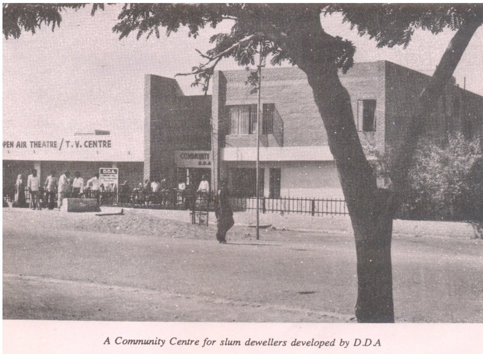
A Community Centre for slum dwellers developed by D.D.A

It is expected to release 9,000 plots every year of different sized measuring 32 sq.mt. 48 sq.mt. 60 sq.mt. and thus adding up 18,000 dwelling units of different sizes in private sector, assuming that two dwelling units per plot would be added in this Five Year Plan and the third dwelling unit per plot in the 9 th Five Year Plan.